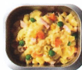
Mac & Cheese